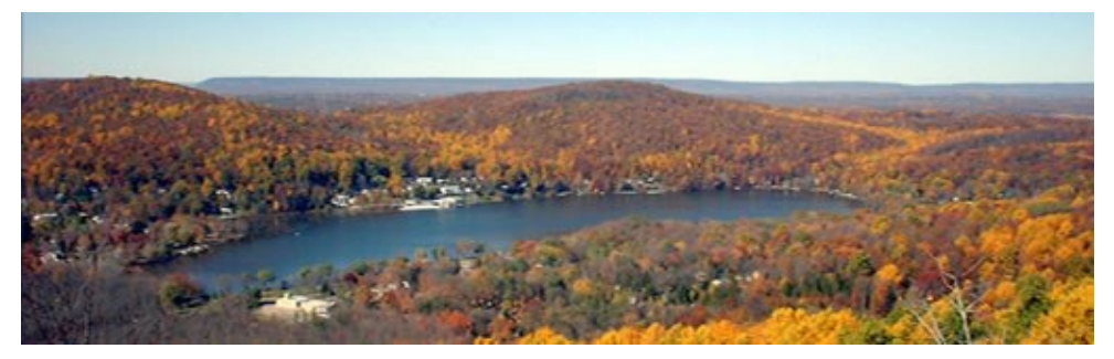
Liberty Township was incorporated as a township by an act of the New Jersey legislature on March 26, 1926, from portions of Hope Township, based on the results of a referendum held on April 30, 1926.